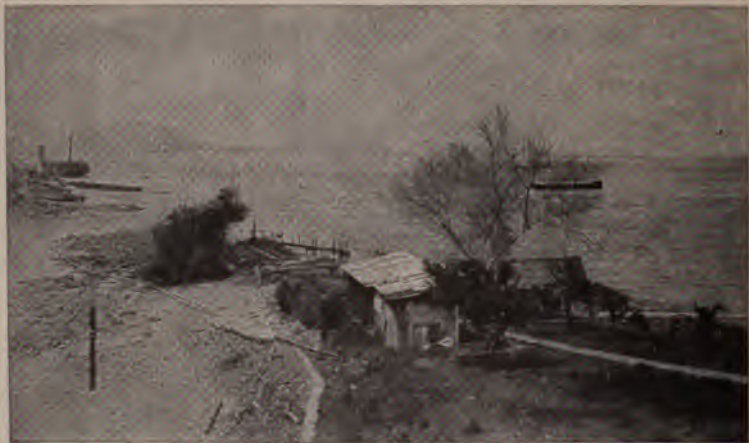
"Across the bay on the lower slope of a long hill drowsed the city of Panama"